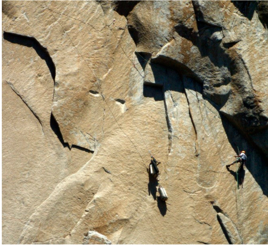
Climbing at the end of the Molar Traverse Mescalito