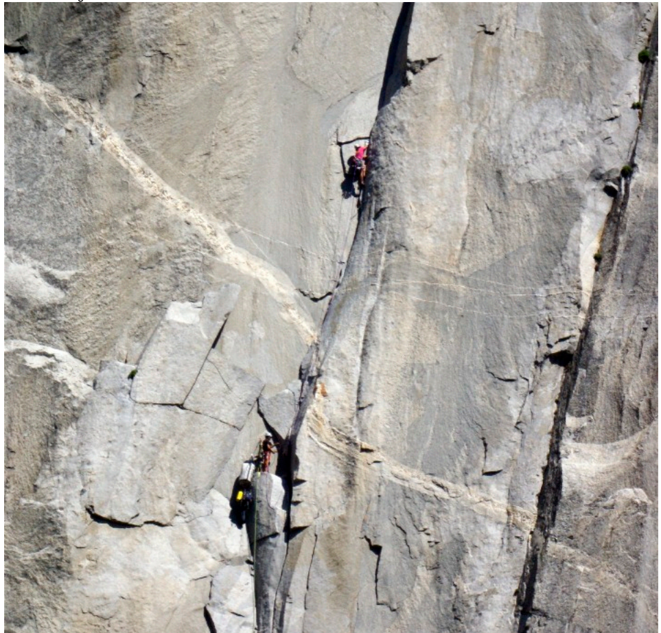
Long lunch on ECT Nose route EICapitan