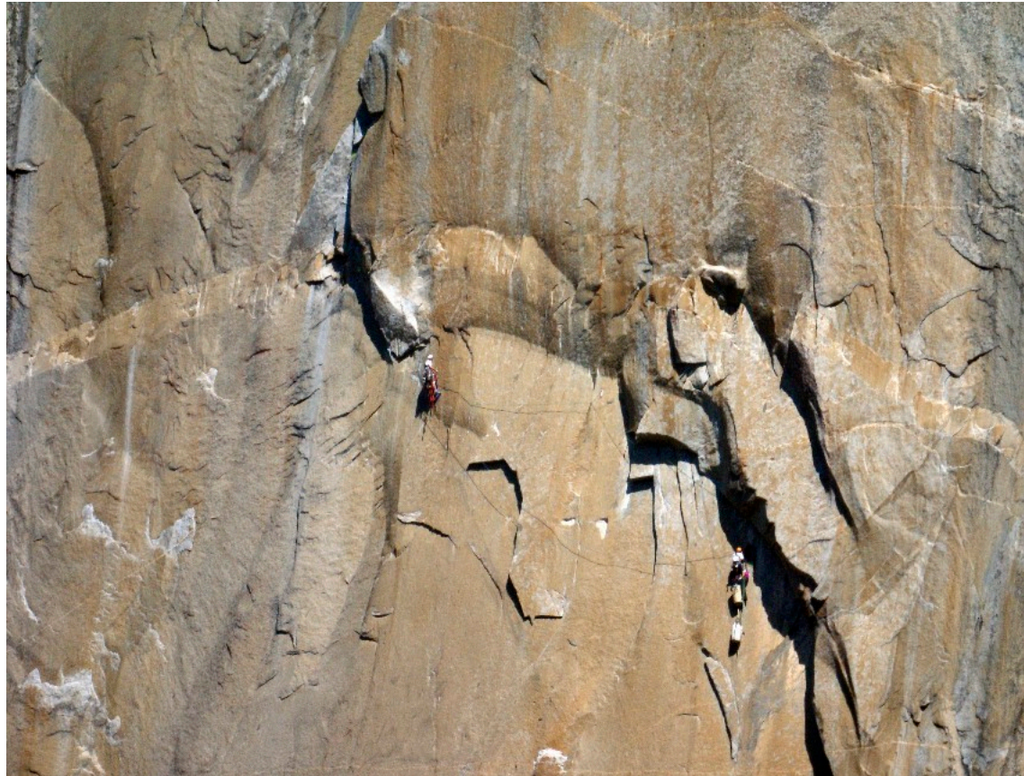
Trying to get the bags back!