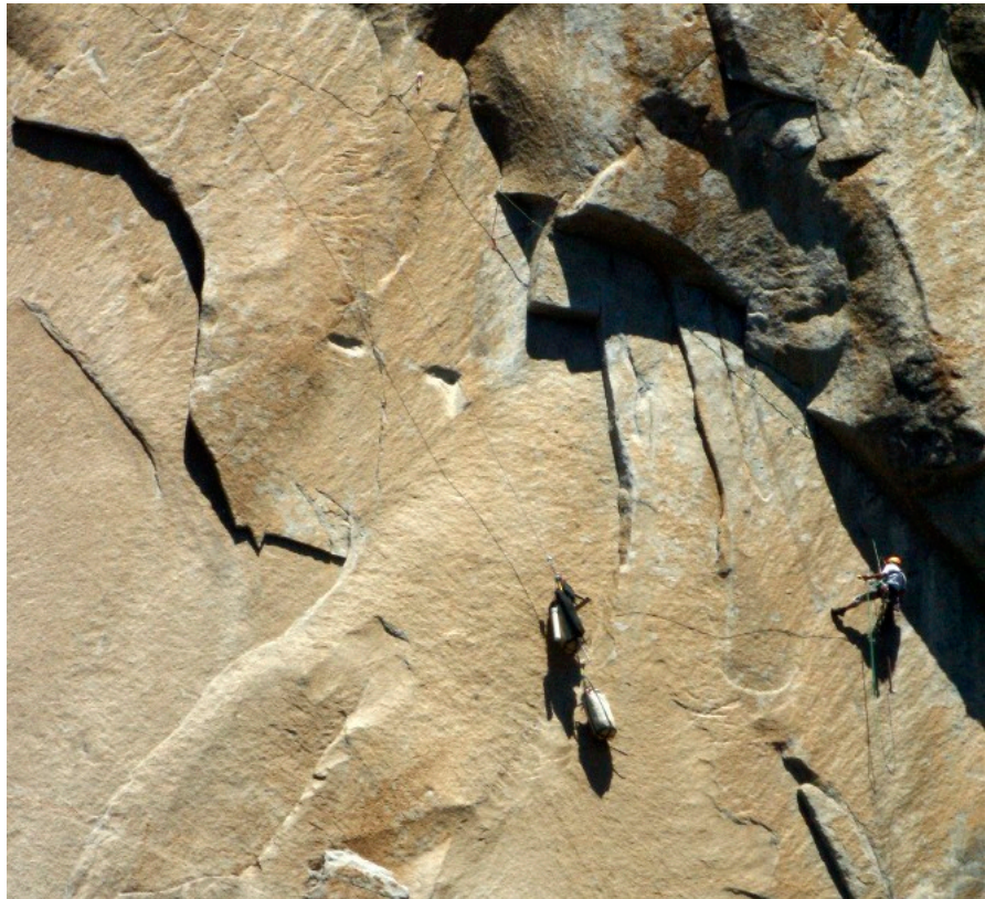
Climbing at the end of the Molar Traverse Mescalito