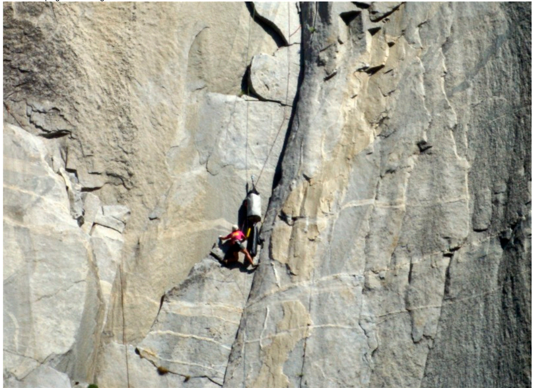
Barefoot hauling above Dolt Tower notice the difference the colorful shirt makes!