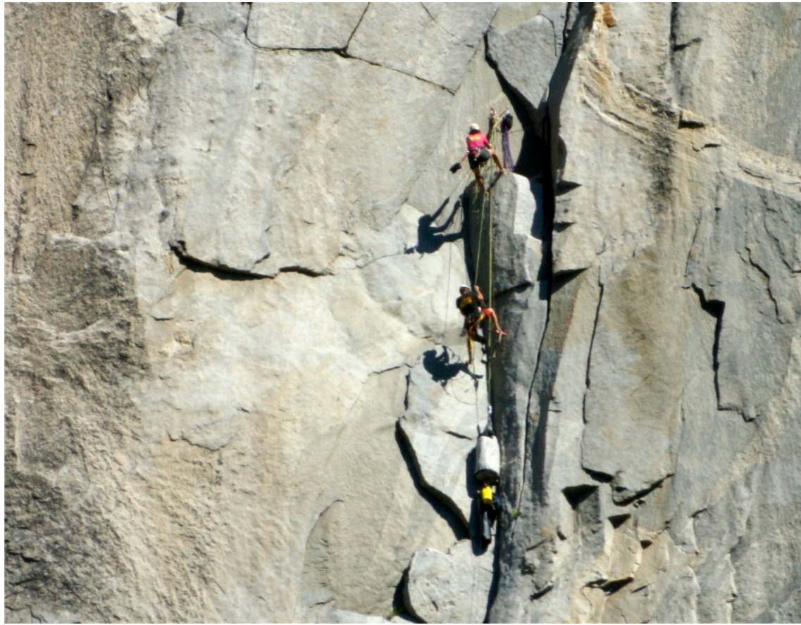
Rachael leading to ECT Nose route